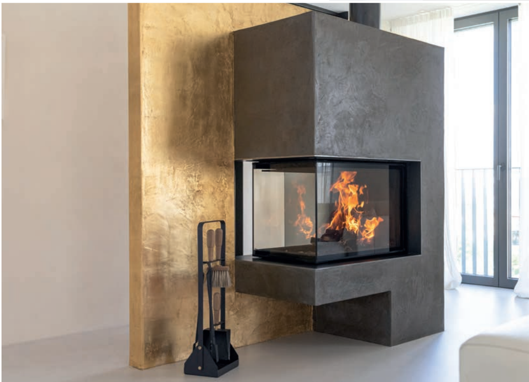
RÜEGG Studio ▶ Salzburg, Austria (left) ▶ Steckborn, Switzerland (right)